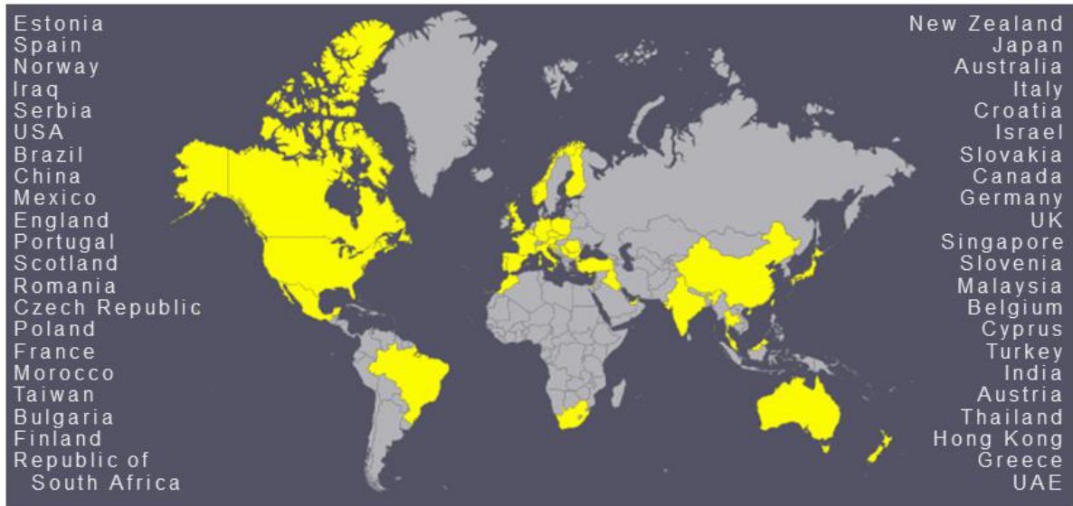
Figure 1. 100+ tertiary educators from over 40 countries.

event to be truly international, with world-wide representation. As the map of attendees (Figure 1) attests, this goal was achieved.