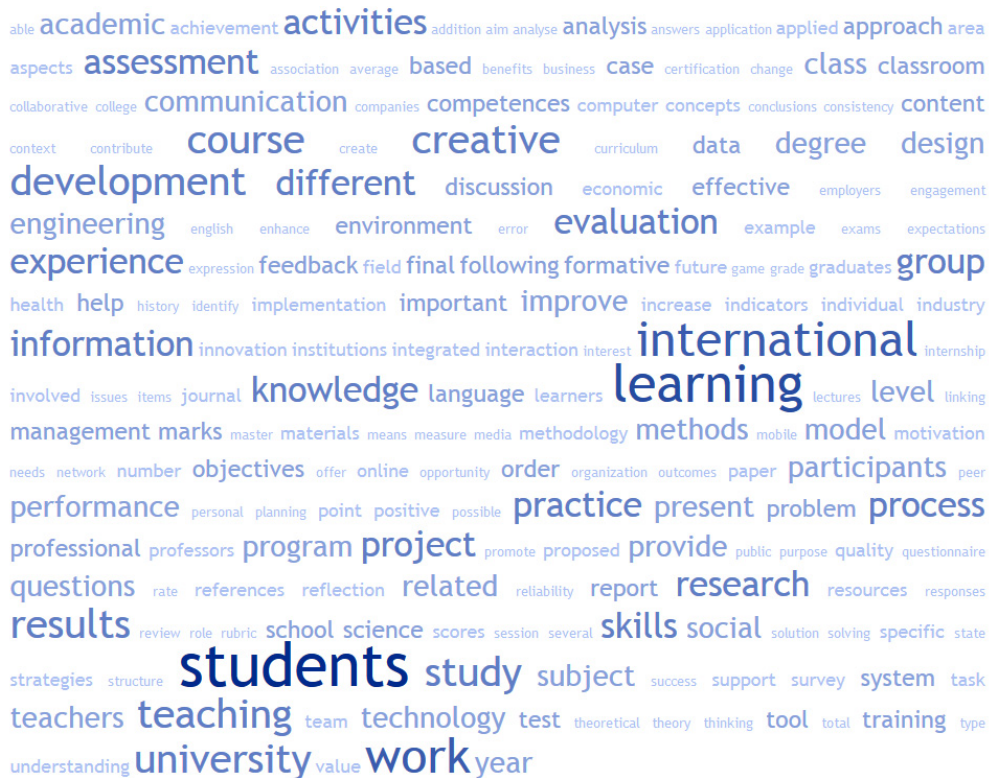
Figure 2. Word Cloud of terms in HEAd'15 Conference Word cloud generated and edited using TagCrowd - top 200 terms of >11,000 terms used > 5 times.

Of the 84 papers, more than half of the papers (47 in total) had a focus on innovative teaching and technology. Frequently that focus was paired with competences and employability (9 papers) or student reflections and perspectives (10 papers). The next most prevalent theme was student reflections and perspectives (36 papers); this subject also had a strong pairing with another category: assessment and evaluation (9 papers).