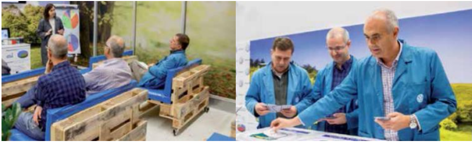
Figure 2. Employees attending the face-to-face course

In starting the training course, it was decided that training material would be used for a face-to-face course with all the workers at Volkswagen Navarra. It was decided that a face-to-face course would assure that all the current employees would take the course, as the company gave the participants release time so they could take it.