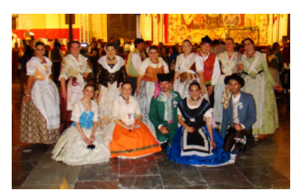
Guest Appearance: Grupo "El Garbí", Falla García Lorca-Olta