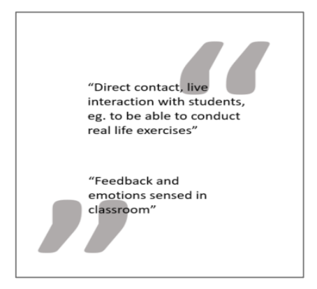
Figure 2. Perceived lacks (quotes from the category "direct interaction/communication with students").

Only six answers could be assigned to the category feedback/exchange with colleagues (c.f. Boer 2021). For example one respondent listed: "interaction, social contact, small talk, feedback, peer to peer communication".