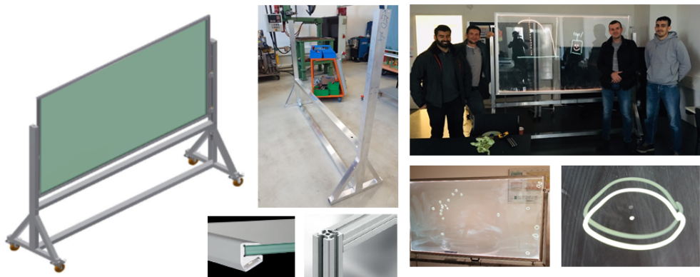
Figure 2. Images of lightboard production and glass micro flaws/precipitations.

3 different designs were presented differing in complexity of the design. After presentations and approximately 4 hours of discussion the students agreed on a design comprising of electrical adjustment of height (Figure 2). The group defined new competencies and responsibilities with 1 student in charge of welding, 2 for orders, 2 for room installation, 2 for construction and 2 for documentation.