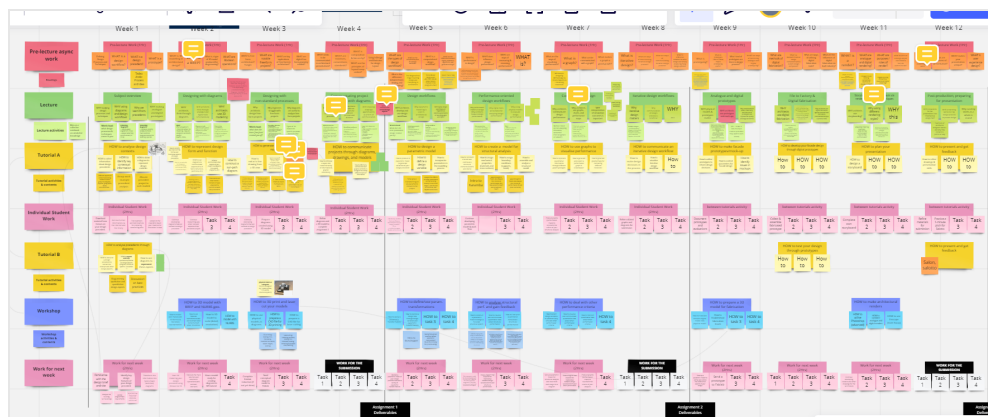
Figure 2: Miro board developed to structure lecture, tutorial and workshop activities, in association with assignment guidelines and deliverables.

The starting point for advancing the strategy in greater detail was developing new learning outcomes and associated, assessment tasks. Four learning outcomes were defined, with three key tasks aligned to them (see Figure 1).